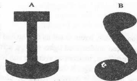
Figure 2: Shape change from A to B